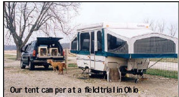
Our tent camper at a field trial in Ohio

Our hunting trip this year was just as successful as the fishing trip. No, we did not get 500 pounds of pheasant. Just seven of them. We had some fun for Thanksgiving.