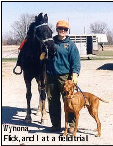
Wynona, Flick, and I at a field trial

We are now ready to do some more field trials. We have a tent camper to sleep in. I also found "Wynona", a horse that I can look straight in the eye.